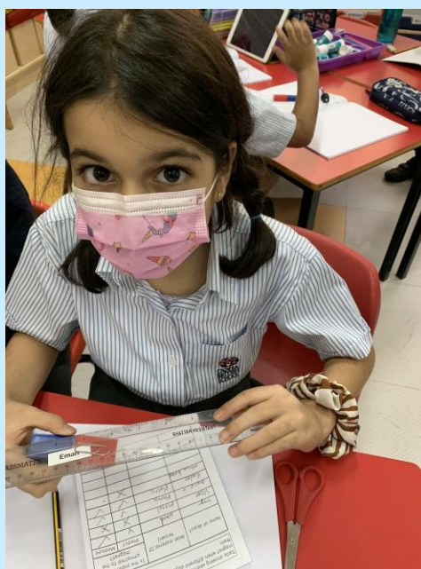
3C Science lesson - exploring magnetic materials