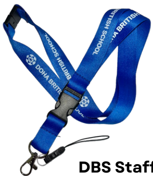
DBS Staff Lanyard