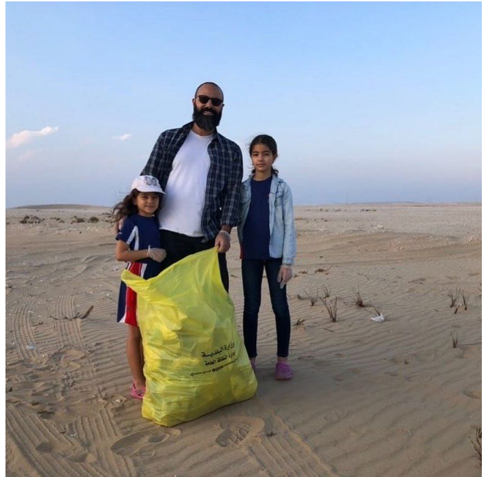
DBS Wakra families at the Desert Clean up