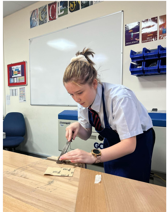
Students working hard in DT and PE